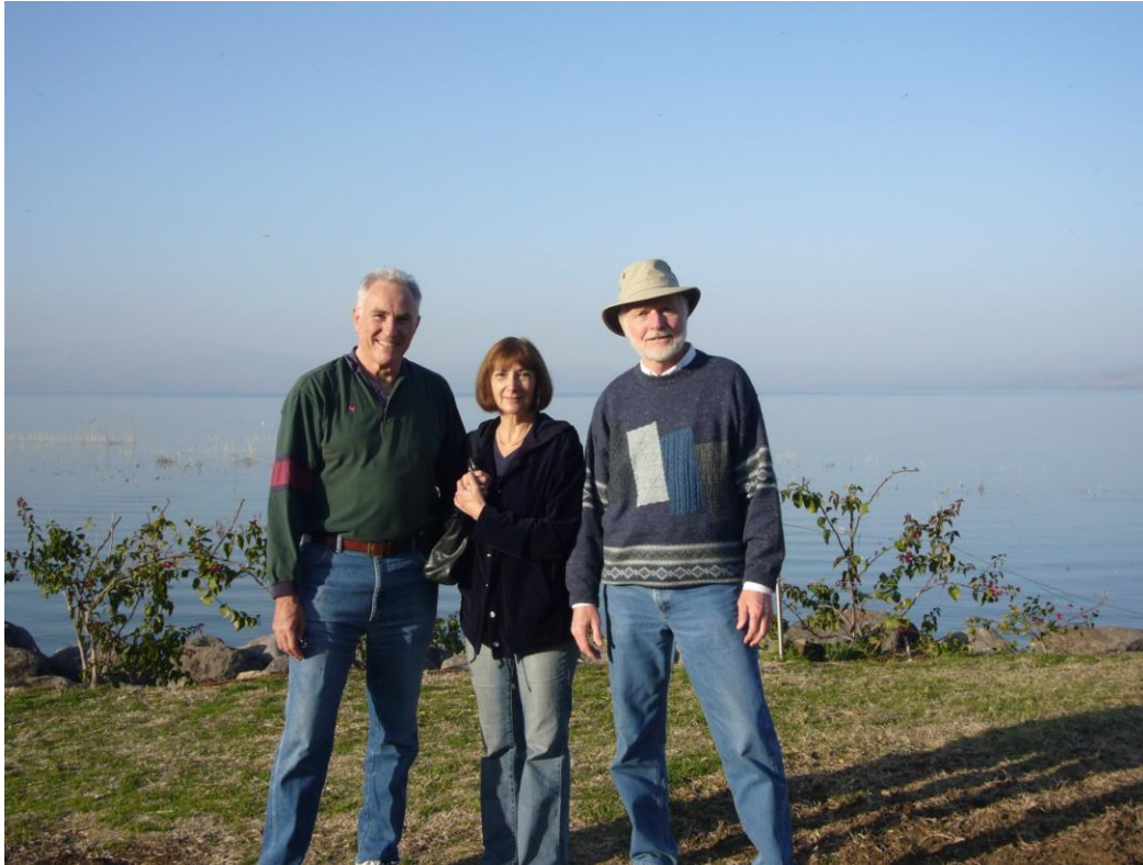
Near the Sea of Galilee