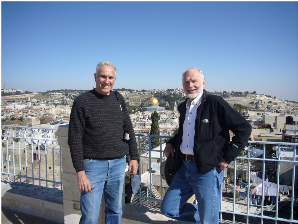
A view of the old city of Jerusalem from the roof of a Church in the city