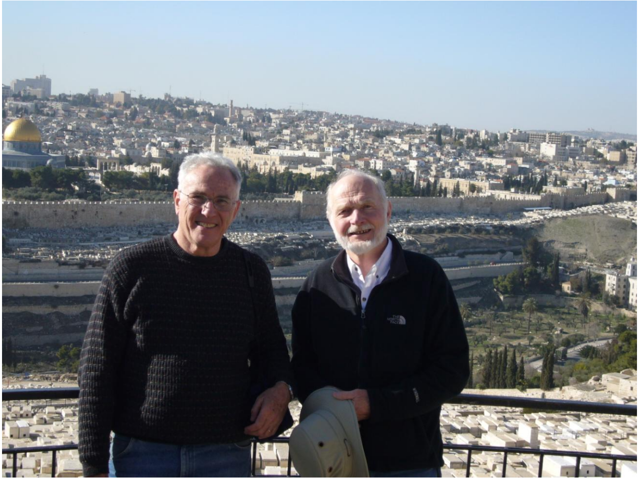
A view from the Mt of Olives