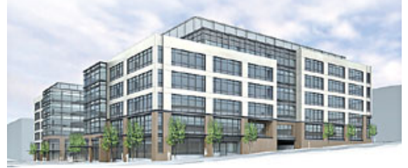
Rendering of one of Vulcan's proposed buildings on the Amazon campus.

To be developed by the real estate division of Vulcan Inc., a Paul Allen company, the campus will feature a new Seattle Streetcar line, which also connects riders to the bus tunnel and light rail. Crucial to the deal were new regulations approved by the Seattle City Council in December 2007 that allow for increased building heights, among other measures. Also important to the deal was a provision for Vulcan to invest in affordable housing. Consolidation is part and parcel to the deal too, as the campus will replace five scattered buildings connected by bus routes. Seattle and Vulcan hope for even more productivity out of bustling South Lake Union too, which already boasts occupancy by Microsoft, REI, Zymogenetics, the Bill and Melinda Gates Foundation and the Fred Hutchinson Cancer Research Center.