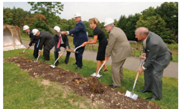
Westinghouse officials at groundbreaking ceremony.

The company ultimately could occupy as much as 1.2 million sq. ft. (111,500 sq. m.) on a new campus owned by Wells Real Estate Investment Trust II and developed by Trammell Crow Real Estate Development & Investment. Partners on the project included the Governor's Action Team, the Greater Pittsburgh Chamber of Commerce (an affiliate of the Allegheny Conference on Community Development) and the Pittsburgh Regional Alliance. Competing with the South Carolina suburbs of Charlotte, N.C. as the project came down to the wire, Pennsylvania retained one of its most prized corporate citizens thanks to special legislation passed in November 2006 that created tax breaks in Strategic Development Areas. With the 15-year tax abatements made possible by the new legislation, the company will save a total of $45 million.