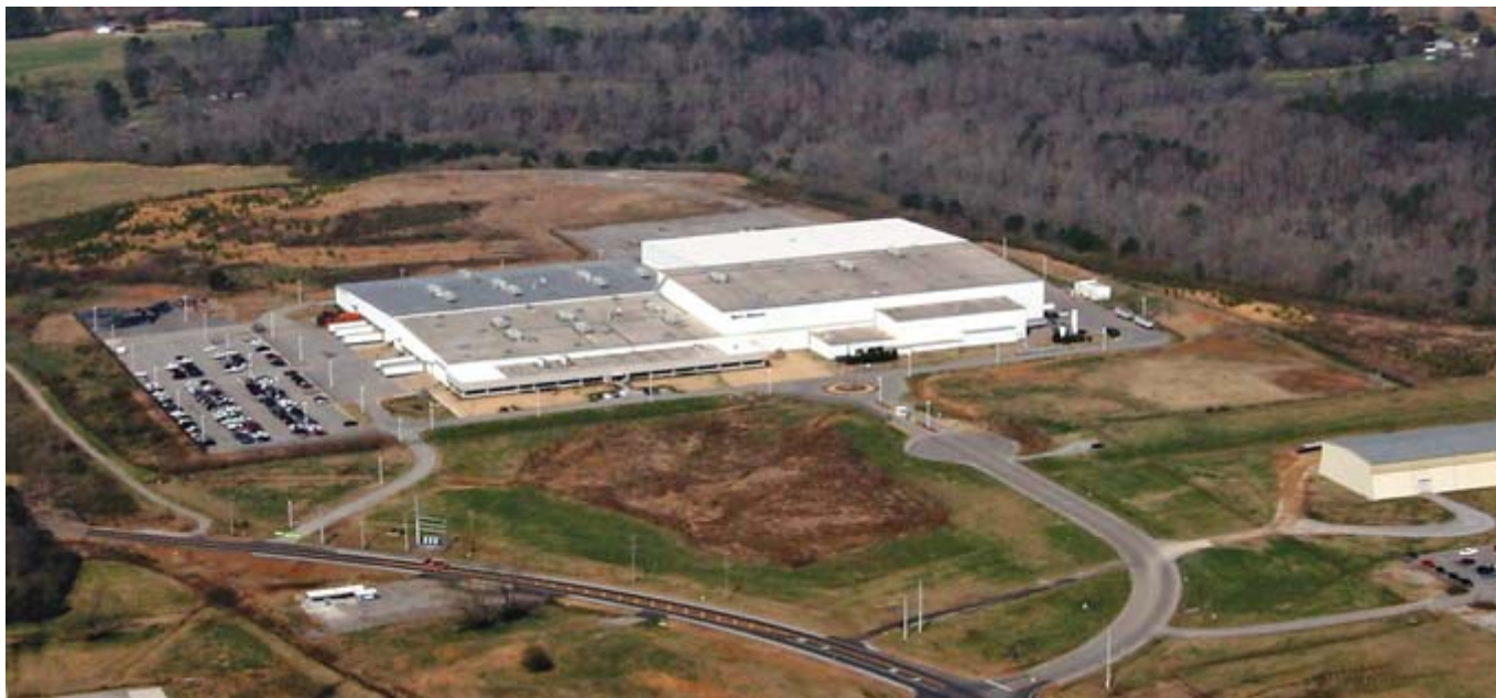
Topre America's facility which recently made an announcement of a $109-million, 250-job expansion.