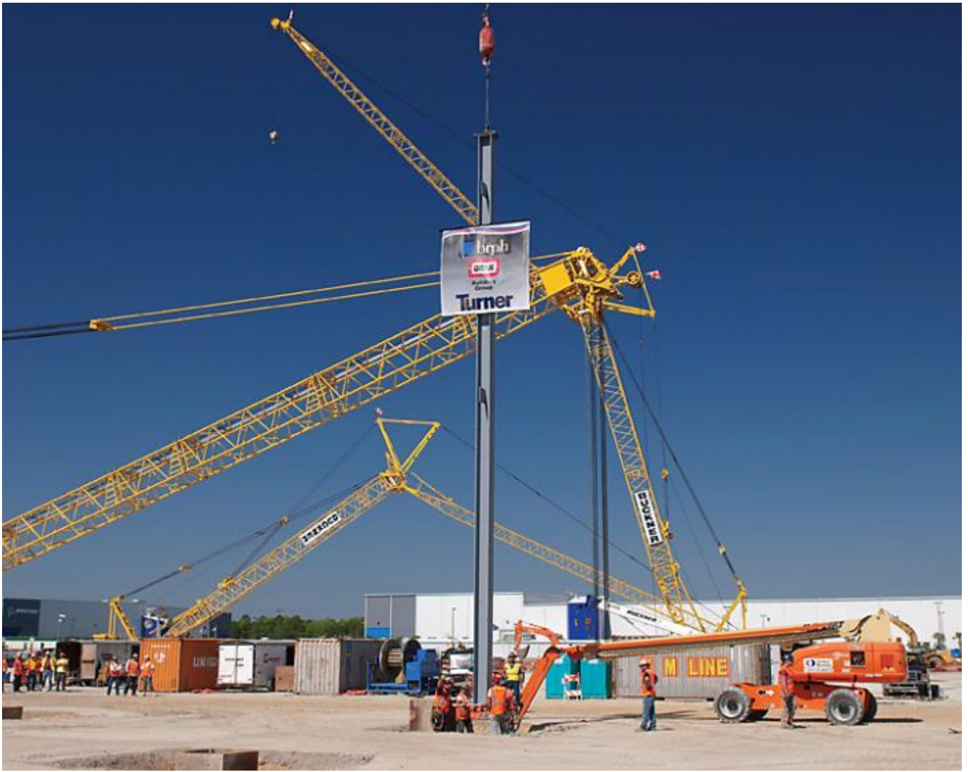
On April 5, 2010, the first steel column was placed (left) for Boeing's 1.2-million-sq.-ft. (92,903-sq.-m.) Charleston 787 Final Assembly and Delivery facility.