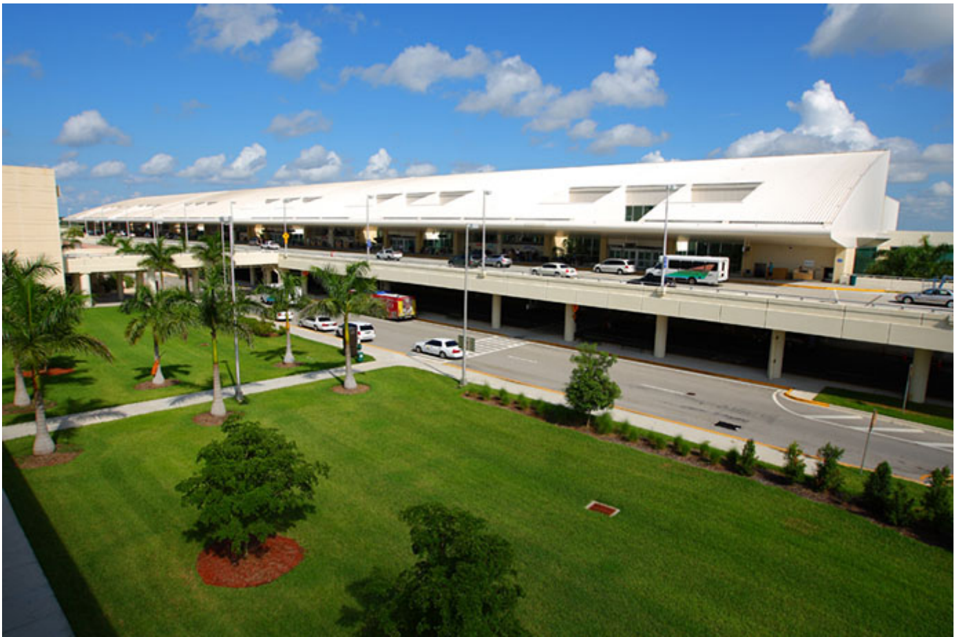
Southwest Florida International Airport in Fort Myers was a key selling point for Hertz.