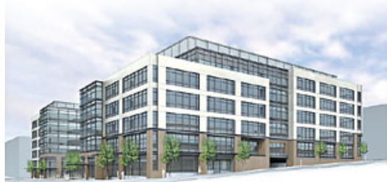
Rendering of one of Vulcan's proposed buildings on the Amazon campus.

To be developed by the real estate division of Vulcan Inc., a Paul Allen company, the campus will feature a new Seattle Streetcar line, which also connects riders to the bus tunnel and light rail. Crucial to the deal were new regulations approved by the Seattle City Council in December 2007 that allow for increased building heights, among other measures. Also important to the deal was a provision for Vulcan to invest in