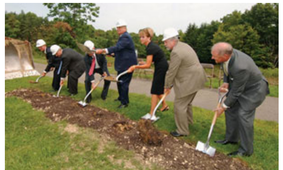
Westinghouse officials at groundbreaking ceremony.

The company ultimately could occupy as much as 1.2 million sq. ft. (111,500 sq. m.) on a new campus owned by Wells Real Estate Investment Trust II and developed by Trammell Crow Real Estate Development & Investment. Partners on the project included the Governor's Action Team, the Greater Pittsburgh Chamber of Commerce (an affiliate of the Allegheny Conference on Community Development) and the Pittsburgh Regional Alliance. Competing with the South Carolina suburbs of Charlotte, N.C. as the project came down to the wire, Pennsylvania retained one of its most prized corporate citizens thanks to special legislation passed in November 2006 that created tax breaks in Strategic Development Areas. With the 15-year tax abatements made possible by the new legislation, the company will save a total of $45 million.