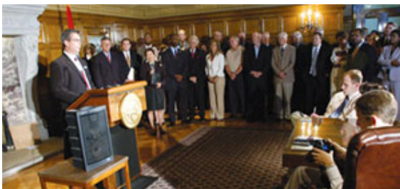
As of February 2008, LM Glasfiber already had 190 employees at a temporary site in Little Rock, and was shipping out its first three blades to customer Acciona Windpower North America.

After running into the runner-up prize for several big-ticket corporate project investments, Arkansas could look to Little Rock for a string of first-place finishes in 2007, headlined by this wind turbine blade factory investment