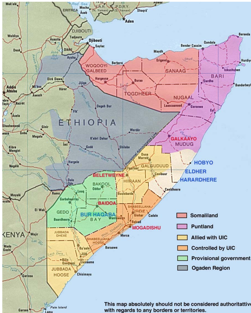
Map 4: ICU expansion in Somalia