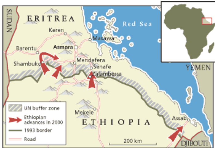
Map 3: Eritrean-Ethiopia border war (1998 – 2000)

Under the Algiers Agreement, Eritrea withdrew its forces back 25 kilometers from the Ethiopian lines, with the vacated "transitional security zone" subject to monitoring by an international peacekeeping force, the United Nations Mission in Ethiopia and Eritrea (UNMEE), with an originally authorized troop strength of 4,200 that has subsequently scaled back to under 1,700. The border dispute was submitted to international arbitration by a specially-appointed Eritrea-Ethiopia Boundary Commission (EEBC). The EEBC was mandated to delimit the border on the basis of a series of early 20th century colonial treaties and "applicable international law."