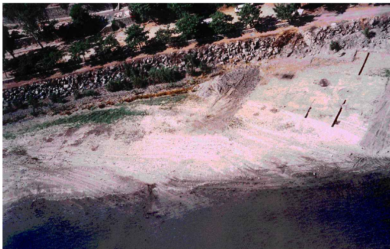
Figure 2 Aerial photo of Ohalo II camp during excavations, looking west. The dark oval areas between the narrow trenches are floors of in situ Late Pleistocene brush huts. Sediments at bottom left are post-occupation. Water level is about -213 m (photo by Arik Baltinester).