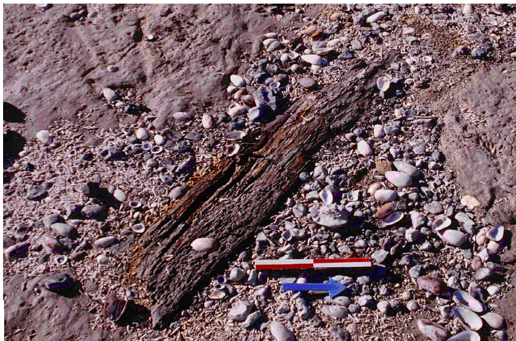
Figure 4 A Salix trunk embedded in Late Pleistocene clay sediments at Beit Yerah Southern Beach. Scale bar is 20 cm..

would probably have decomposed before the later ones would have been deposited. Thus, the facts that they are concentrated (and not visible elsewhere on the beach) and excellently preserved reflect one short depositional episode followed by an immediate water level rise. It is also noteworthy that the trunks do not look like the remains of natural bank vegetation. The absence of other tree parts and other species, and the presence of a gazelle horn core and isolated bones might indicate human intervention here. This can only be tested in future excavations (water levels permitting).