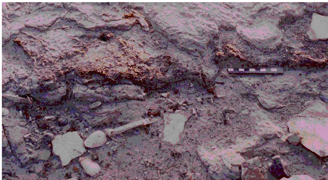
Figure 6 A close-up view of in-situ organic matter in lacustrine sediments at Tel Katsir Beach. Scale bar is 10 cm.

trend. Each water level rise deposited a low-energy cover over the abandoned camp. Thus, the site reflects a time of short water level fluctuations around the -213 m level, and then a high stand long enough to deeply cover the area by additional sediments. Such a rise is evident in the finely laminated layers covering both Ohalo II and Ohalo II South. This event is dated to about 19,500 BP.