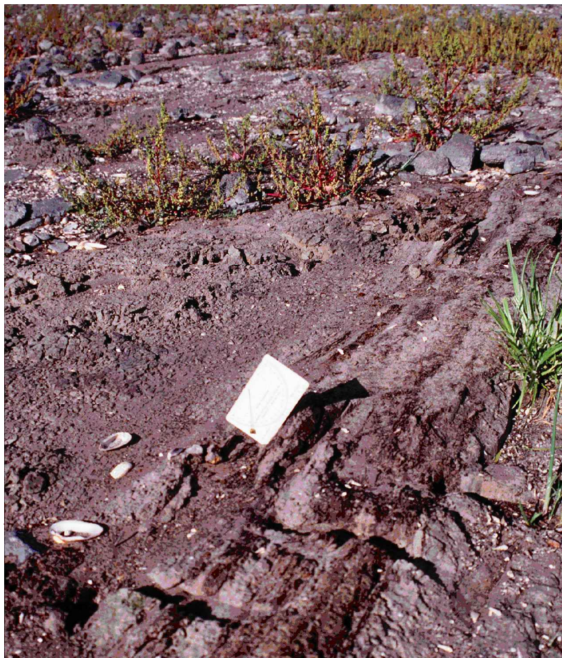
Figure 5 A close-up view of in-situ organic matter in steeply dipping lacustrine sediments near the Salix tree trunks looking northeast (Beit Yerah southern Beach)